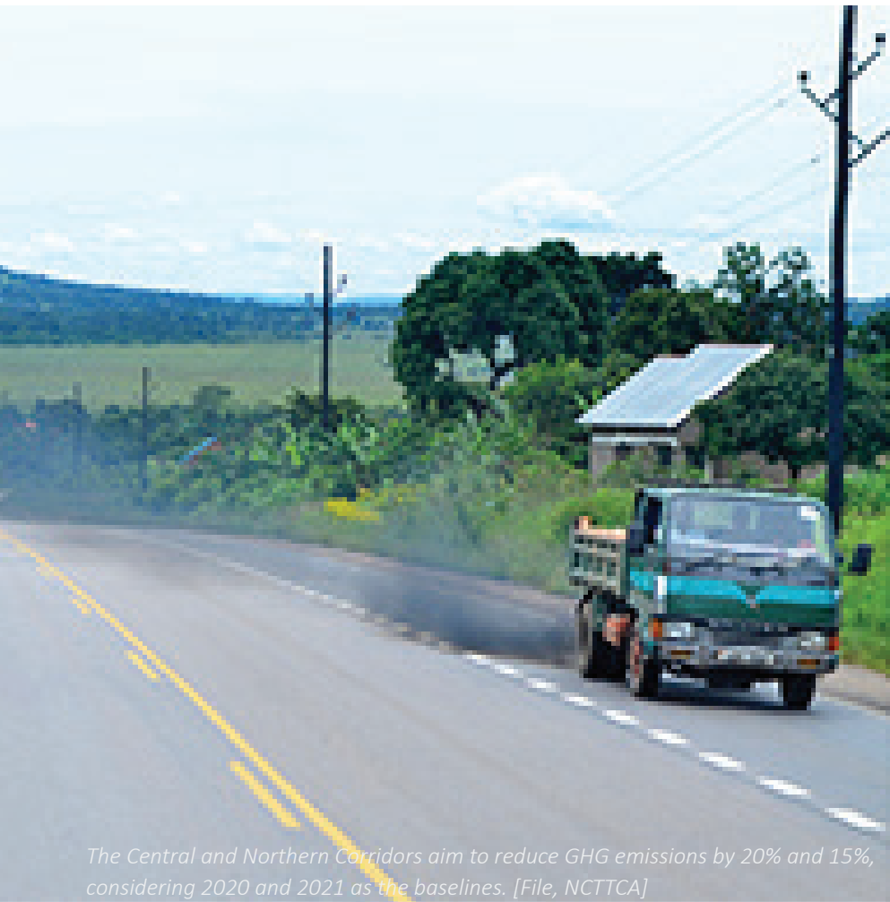
The Central and Northern Corridors aim to reduce GHG emissions by 20% and 15%, considering 2020 and 2021 as the baselines. [File, NCTTCA]

From the findings presented, GHG emissions of the Northern Corridor are 1.72 MMtCO 2 e (million metric tons of carbon dioxide equivalent) while that of the Central Corridor is 1.24 MMtCO 2 e. In the Northern Corridor, the GHG intensity for onward journeys was 1.0 MMtCO 2 e while that of the return journey when loaded was 0.30 MMtCO 2 e, and empty return trips at 0.42 MMtCO 2 e. Onward journeys in the Central Corridor contributed 0.73 MMtCO 2 e while the