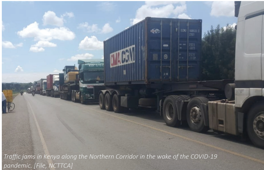
Traffic jams in Kenya along the Northern Corridor in the wake of the COVID-19 pandemic.

In general, the performance of the Port of Mombasa and the entire Northern Corridor was affected by disruptions caused by restrictions introduced in response to the COVID-19 pandemic,