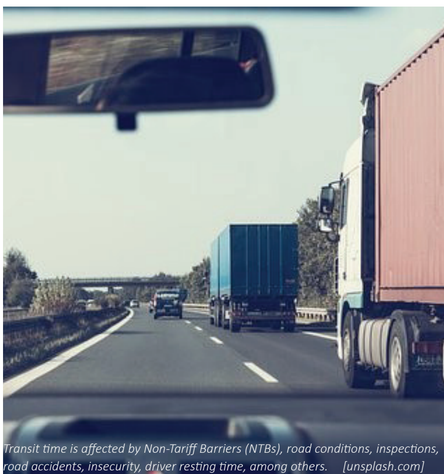
Transit time is affected by Non-Tariff Barriers (NTBs), road conditions, inspections, road accidents, insecurity, driver resting time, among others.

According to the Northern Corridor Dashboard Quarterly Performance Report for the period October to December 2020, transit time from Mombasa to Kampala reduced from 167 to 131 hours, 167 to 135 hours from Mombasa to Elegu, 214 to 187 hours from Mombasa to Kigali,