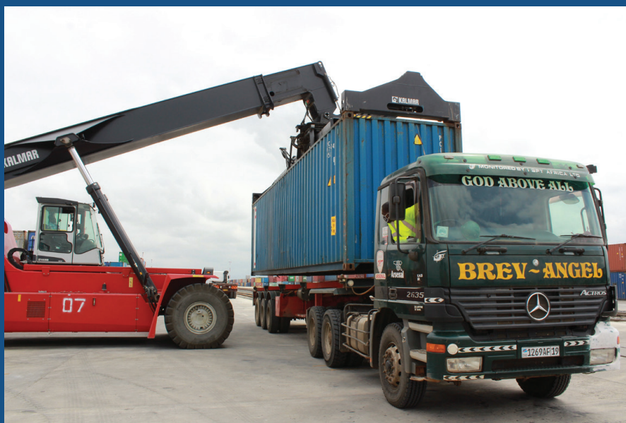
A rubber-tyred gantry crane loads a container onto a truck in Naivasha ICD.

Rehabilitation works on the Metre Gauge Railway are underway to link the Naivasha ICD to the Kenya-Uganda border to bring cargo even closer to destination for the transit countries.