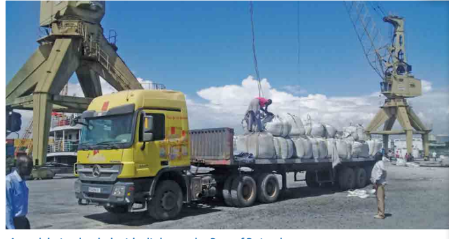
A truck being loaded with clinker at the Port of Bujumbura.