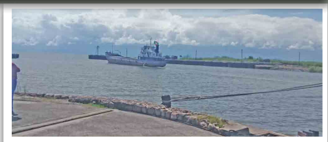
A vessel leaving the port of Bujumbura after discharging its clinker. The clinker is delivered to Bujumbura via Lake Tanganyika. The potential for Lake Tanganyika to offer inland water transport to connect the Region to the Southern African countries is yet to be exploited.