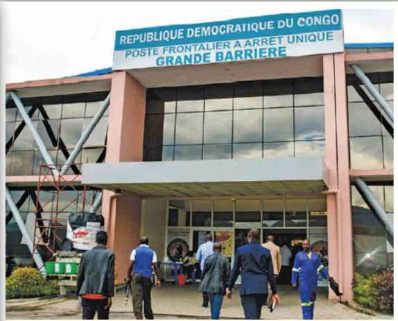
December 2019 , Grande Barrière OSBP offices at Goma – DRC/Rwanda border station. The newly built OSBP,s structures have facilities that can be used to host Joint Border Committee meetings which used to be a challenge.