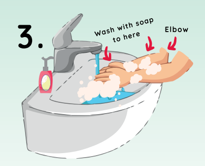
Self-Hygiene- Thoroughly Wash your Hands regularly, as a precautionary method.