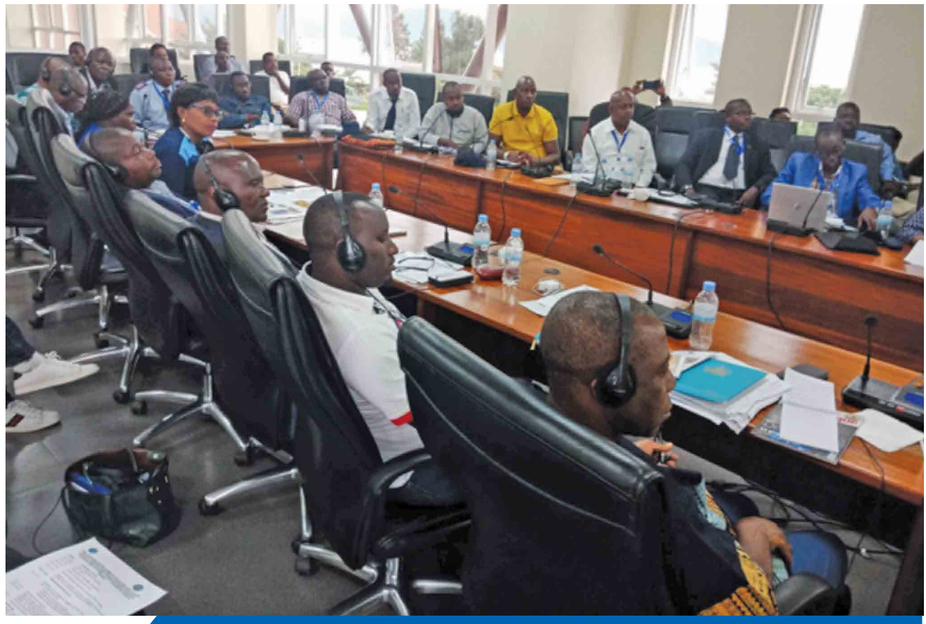
The Stakeholders sensitisation Team at Rubavu/Goma Border Crossing Station between Rwanda and DRC

During the ten-day mission, three stakeholders' sensitization workshops on use of the shorter alternative route to Mombasa from Burundi, DRC and Rwanda were held during which some of the challenges being faced by the truckers along this route were highlighted. A good number of the challenges highlighted were not unique to this route but the entire transport corridor networks.