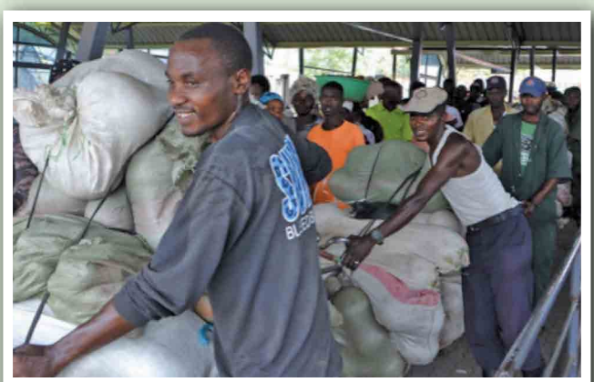
Small scale cross border traders at Rubavu OSBP. About 50,000 people cross the Rubavu-Goma OSBP daily. The majority of whom are women and youth, they mainly deal in goods produced in the adjoining Member States. Some of the small-scale traders' goods especially those dealing in manufactured goods are to benefit from use of the Simplified Trade Regime at Goma. Their goods are deposited in the warehouses in Goma and subjected to the same clearance processes like the big scale traders.