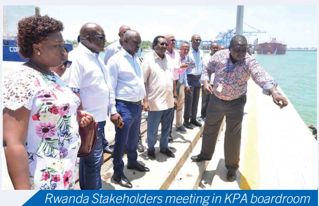
during their tour of the port facilities.

During the Rwanda Stakeholders' meeting with KPA officials, the visiting delegation was briefed on key infrastructure and technological developments that have been implemented to enhance the efficiency of the Port operations.