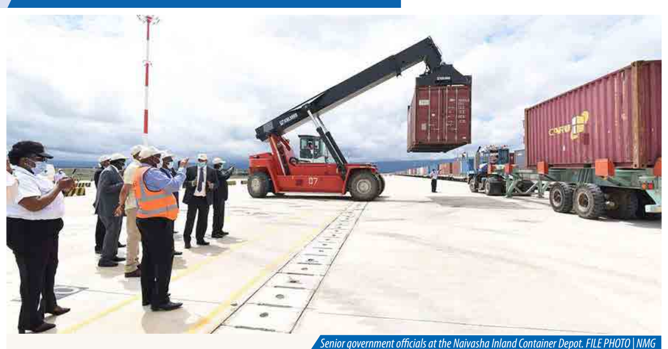
Fast-tracking the development of Naivasha ICD and regional Inland Waterways: a boost to a resilient trade and Transport Logistics system

The Northern Corridor Policy Organ Meetings composed of the Executive Committee and Council of Ministers were held between 28<sup>th</sup> and 31<sup>st</sup> July 2020; where Member States reiterated their commitments to use the Inland Container Depot (ICD) facility at Naivasha as well as the Oil Jetties on Lake Victoria to ensure a faster rebound of the economies of the region. The Policy Organs agreed to fast-track the full development and completion of the required amenities at the dry port in Naivasha and continue with the development of key Inland Waterways to boost trade and Transport system in the region.