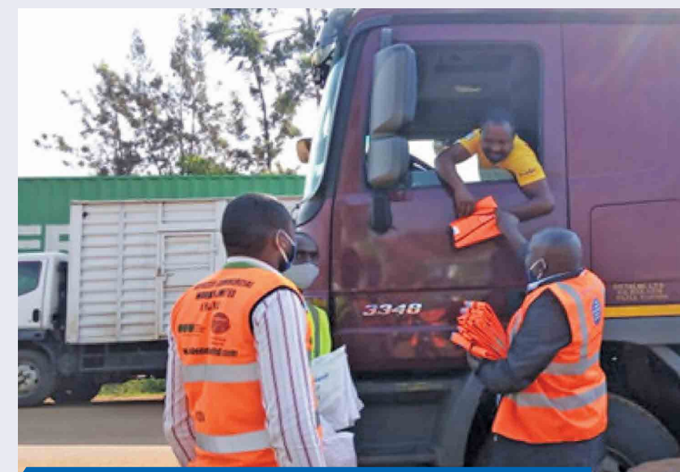
Sensitisation Team during the distribution exercise of 10,000 Masks and Reflector Jackets to Long Distance Truck Drivers at the weighbridges in Busia, Webuye, Mariakani, Mlolongo and Gilgil.

It is understandable that there is confusion, anxiety, and fear among the public. Unfortunately, these factors are also fuelling harmful stereotypes. Stigma is also counterproductive. It can drive people to hide the illness to avoid discrimination, prevent people from seeking health care immediately and discourage them from adopting healthy behaviours.