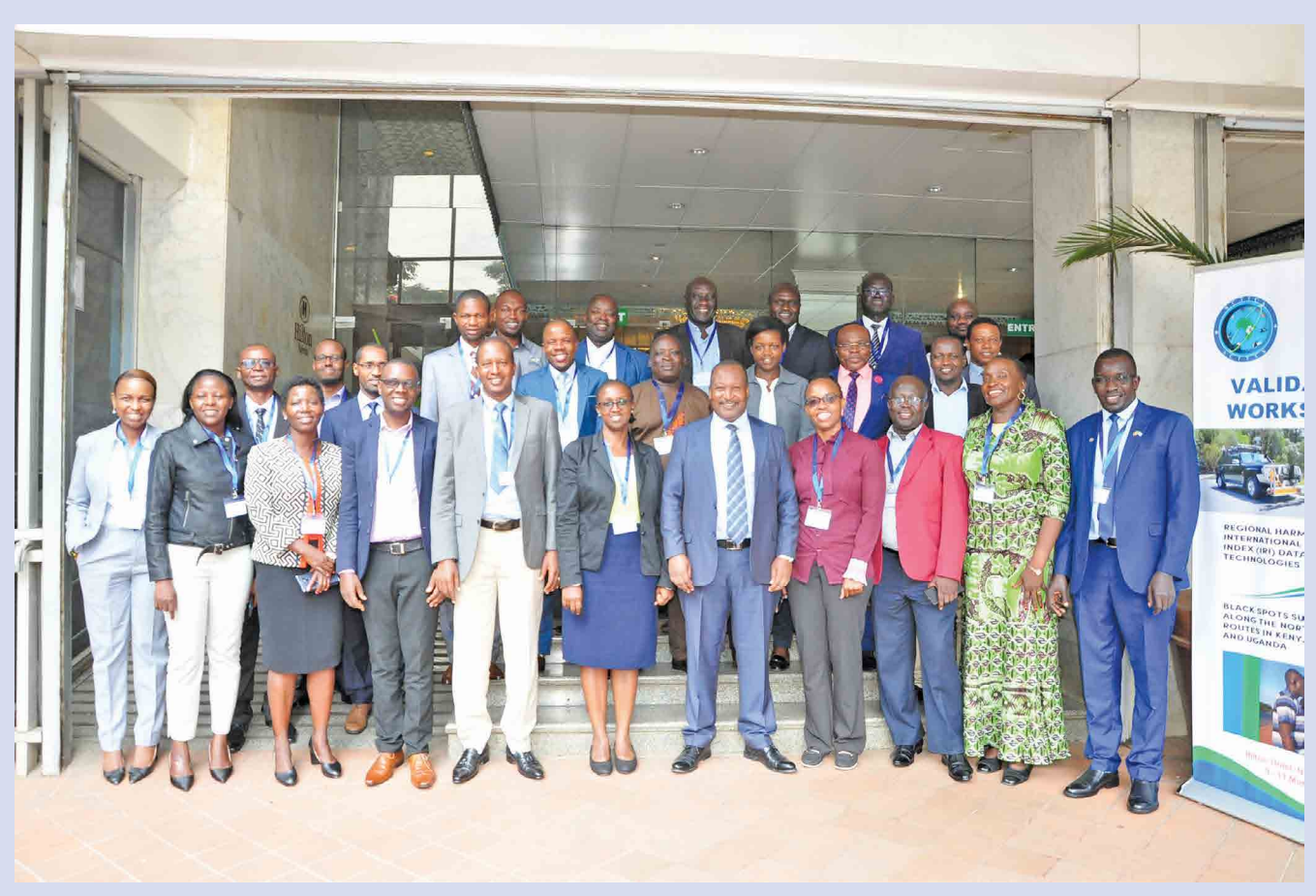
Participants during the Validation Workshops on the International Roughness Index (IRI) data collection and the Black spots survey reports, 9<sup>th</sup>-11<sup>th</sup> March 2020, Nairobi, Kenya.