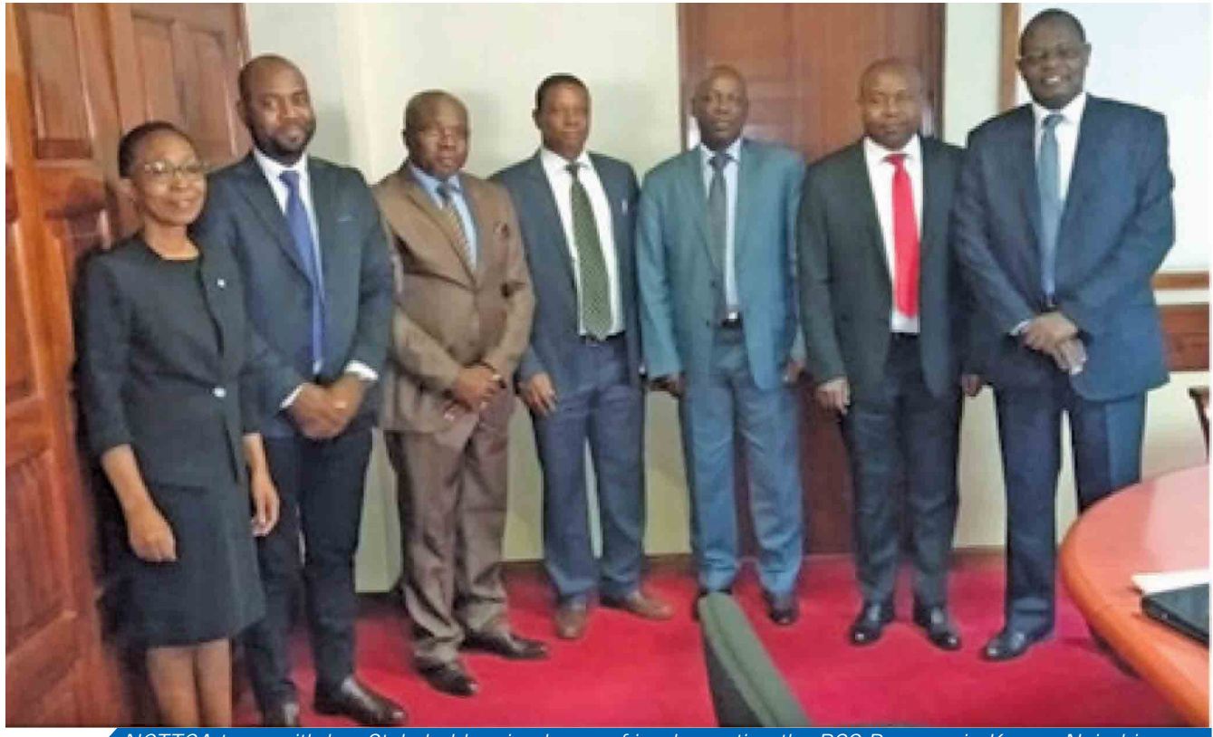
NCTTCA team with key Stakeholders in charge of implementing the RSS Program in Kenya, Nairobi, 25<sup>th</sup> February 2020.

According to the Mlolongo wellness canter clinic officer, in 2019, 3,029 drivers were served while 392 drivers have been attended to up to February 2020. It was mentioned that they look at Primary Health Care that comprises 29 illnesses. Among which: Screening for diabetes and hypotension, STI infections, TB treatment for all community and truck drivers. Mlolongo wellness centre has the Outreach Department, Cancelling and Testing Department, Multisector Department that