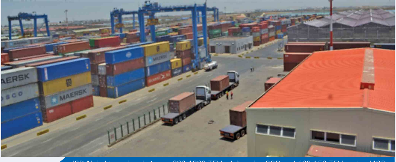
ICD Nairobi receives between 800-1000 TEUs daily using SGR and 100-150 TEUs using MGR.

KPA also gave a brief on the progress of Sh30 billion Dongo Kundu free port with an area of 3,000 acres where a Free Economic Zone is being developed. The Free Port will allow traders to bring in their cargo, repackage and export it.