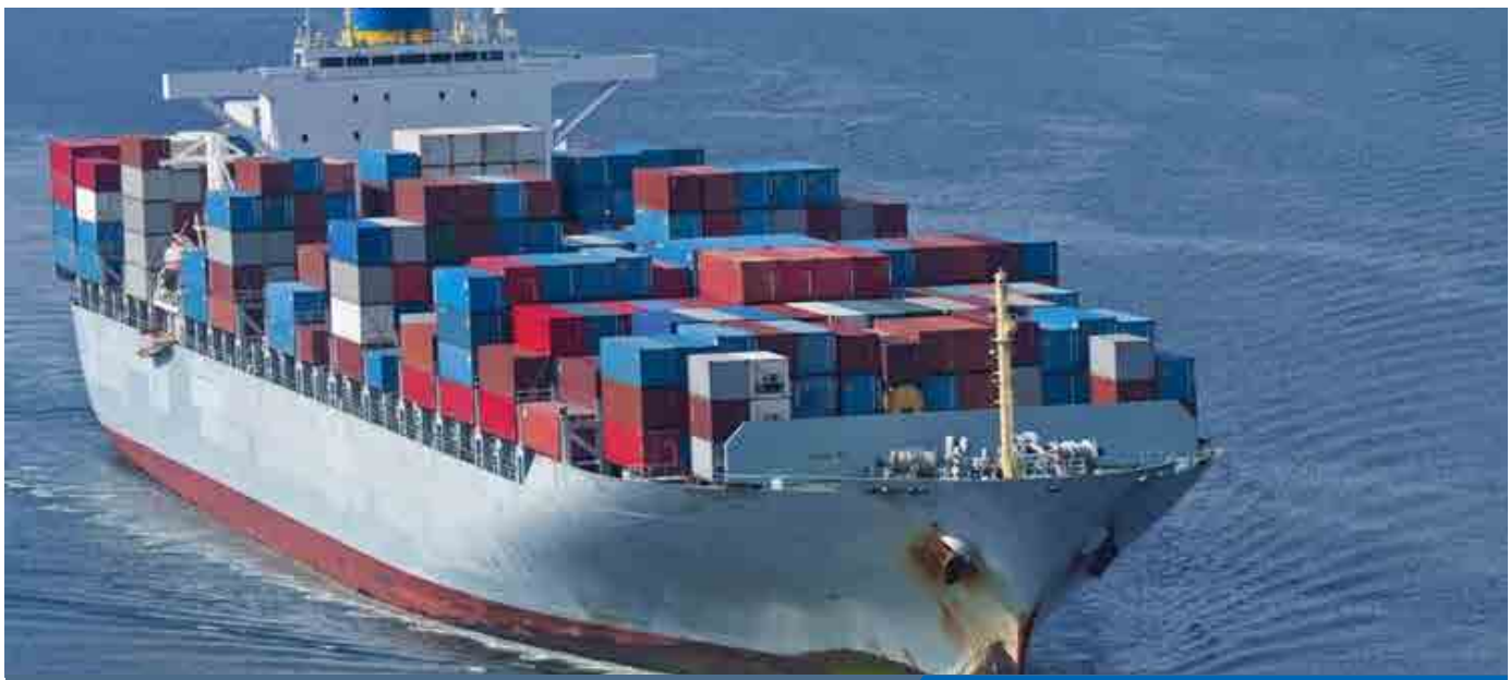
A cargo ship arrives at the Port of Mombasa