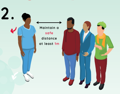
It is a good idea to AVOID large crowds of people Avoid handshake Avoid hugging