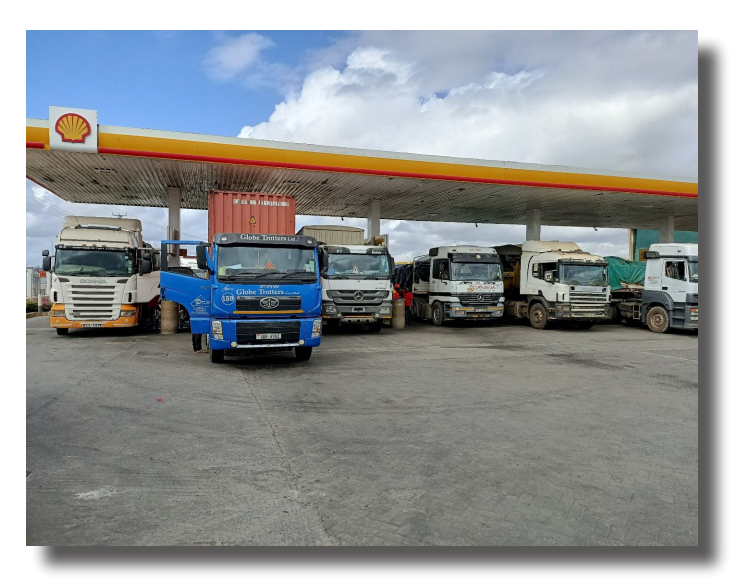
The private sector has invested in facilities similar to RSS though uncoordinated.

The identified parking yards with facilities similar to the Northern Corridor RSS designs that could be upgraded included Shell and Premium Energy Bonje; Maungu Lorry Park by Taita Taveta County Government; Sparkle Centre located in Mtito Andei; Darussalam Hotel and parking facility located in Mtito Andei; Delamere Holding Shop Point in Naivasha; Shell Salgaa at Salgaa; and Uasin Gishu Lorry Park by the County Government of Uasin Gishu locatedat Jua Kali Other proposed parking yards viable for upgrade to RSS but were at conception stage were KeNHA land in Sultan Hamud; Shell and Premium Energy in Mai Mahiu; Mundika Trailer Park - Busia County Government Project; Malaba Park by Busia