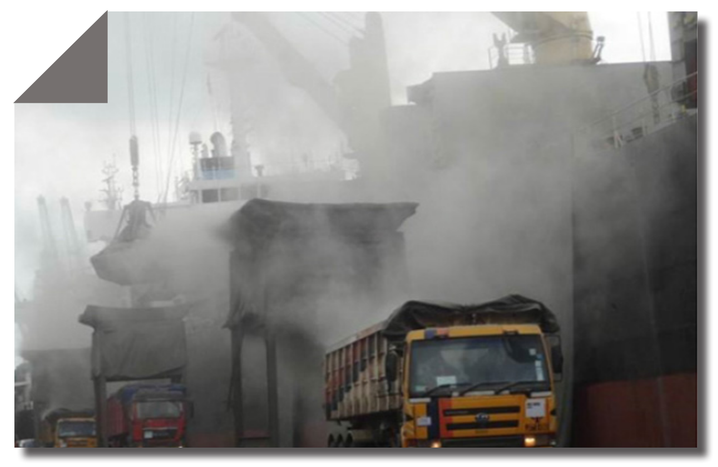
Partner States in both Northern and Central Corridors are urged to embrace modal shift from road to railways and waterways transport modes.

Mbale- Elegu. Along the Central Corridor, the report recommends Morogoro – Isaka, Dar es Salaam – Morogoro, Isaka – Rusumo, Isaka – Mwanza and Isaka – Kabanga for improvement.